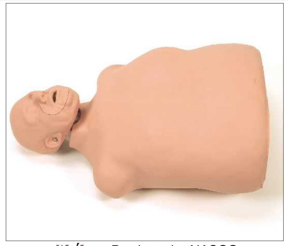
Life/form Products by NASCO